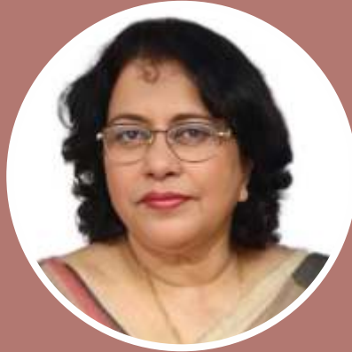
Hony. Secretary General, IMA

It gives me immense pleasure to extend my heartfelt congratulations to the Delhi Medical Association on the occasion of its 66th Annual Delhi State Medical Conference (MEDICON 2025) being held on Sunday, 23rd November 2025, at Hotel Le-Meridien, New Delhi.