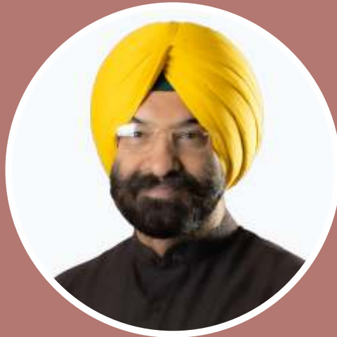
Minister of Industries, Food & Supplies and Environment, forest & Wild Life

I am pleased to extend my heartfelt greetings and best wishes to the Delhi Medical Association on the occasion of MEDICON 2025, the 66th Annual Delhi State Medical Conference.