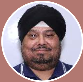
Hony. Finance Secretary, DMA

It is my proud privilege to welcome all the delegates and faculty members on occasion of 66 th Annual