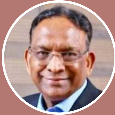
Past National President, IMA

Dear Office Bearers of the Delhi Medical Association,