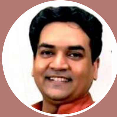
Minister of Law & Justice

It gives me great pleasure to extend my warm greeting and best wishes to the Delhi Medical Association on the occasion of MEDICON 2025, being held as part of the 66th Annual Delhi State Medical Conference. This annual gathering provides a valuable platform for medical professionals, researchers, and healthcare leaders to share their knowledge, innovations, and experiences for the advancement of medical science and patient care.