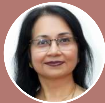
President Elect, DMA