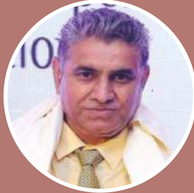
Hony. State Secretary, DMA

It is heartening to note Delhi Medical Association is organizing 66th Annual Delhi State Medical Conference on 23rd November, 2025 at Hotel le-Meriden, New Delhi. Delhi Medical Association is the largest NGO involved in health awareness in NCR Delhi. The role of Delhi Medical Association in various national health programmers is always crucial. On this occasion, Delhi Medical Association is also releasing a Souvenir containing scientific material which will be of great help to general practitioners.