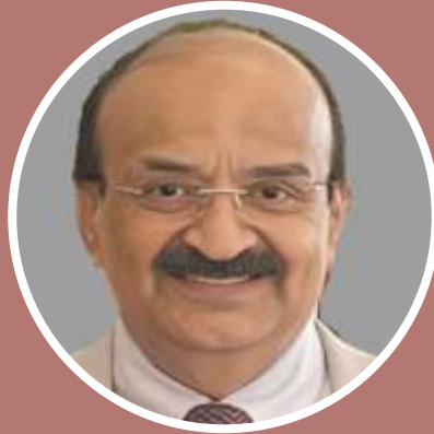
National President, IMA

Greetings from Indian Medical Association Hqs!