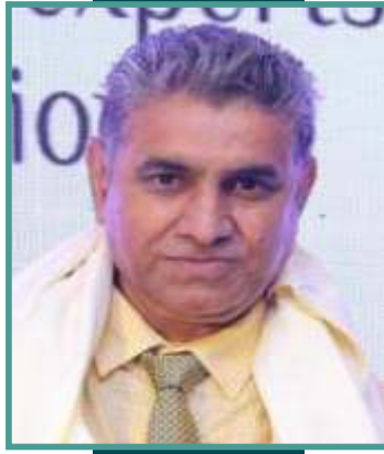
Hony. Secretary Pen...