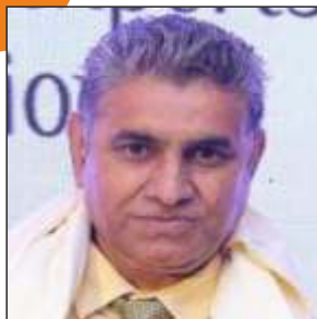
Hony. Secretary Pen...

"I hope this message finds you well. I am excited to share a wonderful opportunity for medical professionals to join the Delhi Medical Association (DMA) through its local branches. Become a member of this esteemed organization and enjoy lifelong benefits."